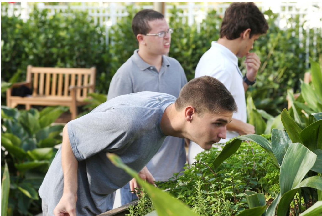
Figure 8. "Sensory rooms" discretely target the five senses. Each room, framed by a distinctive paving band, features curved varying-height custom planters, bringing a rich variety of sensory-appropriate plants within comfortable and easy access.

The designers carefully considered every plant, material, and furnishing for its appropriateness, safety, durability, and therapeutic potential. "Sensory rooms," aligned on the garden's axis, discretely target each of the five senses and feature customized lightweight fiberglass planters—a material that reduced cost and precluded the need for heavy equipment on the small site. The planters' varying heights bring a rich variety of sensory-appropriate plants to a comfortable and easily accessed position for visitors big and small, mobile and seated. Each room is ringed by a dark band in the pavement, forming a subtle visual boundary and signaling a change in sensory experience. Small, movable, musical sculptures activate these spaces with sound. Teachers and therapists reposition the instruments at their discretion to encourage cooperative exchanges or to support an individual's creative explorations.