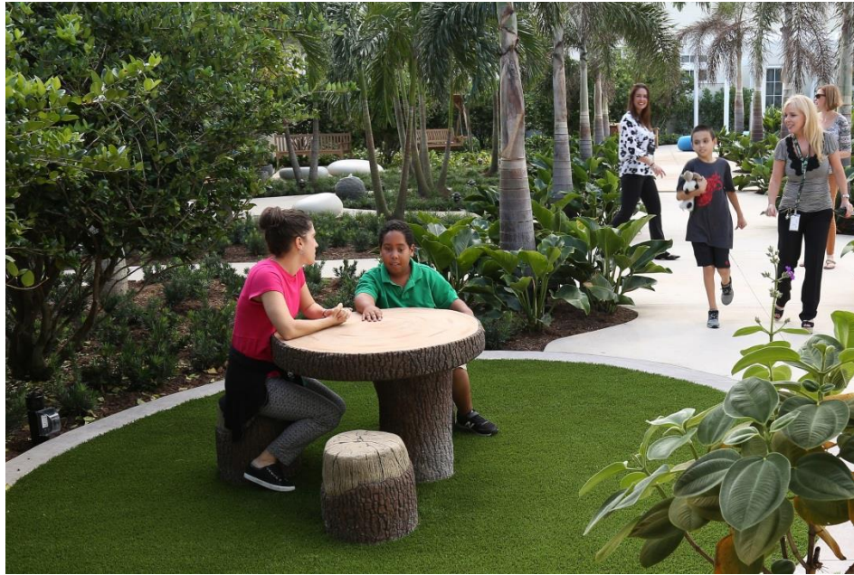
Figure 13. Structured, upper body supporting, straight-backed benches provide stability while “pebble” seats offer a playful alternative and varying levels of proprioceptive and vestibular experiences.