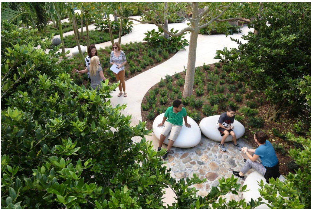
Figure 3. Reduced and integrated sensory spaces provide refuge when experiencing sensory overload. Each space features seating options to acknowledge personal choice.