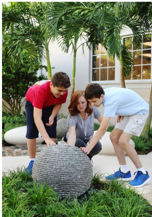
Figure 11. Water spheres provide many sensory experiences.