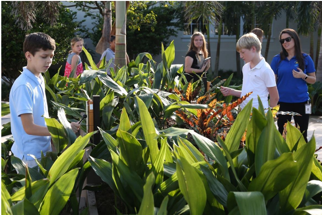
Figure 10. The suite of musical sculptures enriches the tactile and auditory textures of the garden.