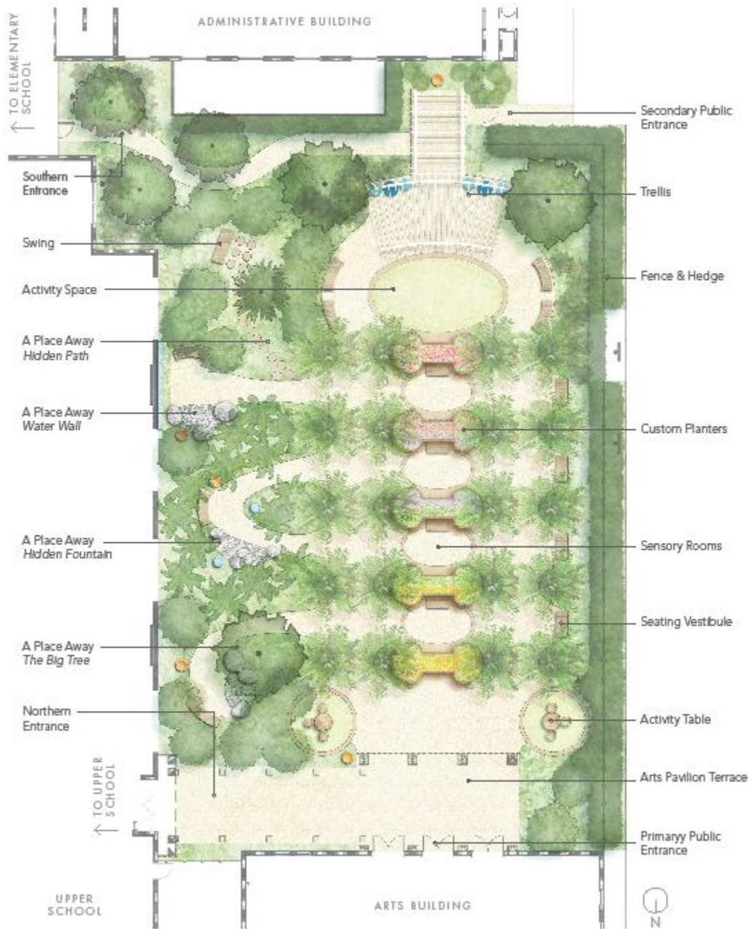
Figure 1. Enclosed by a verdant planted perimeter, the overall layout offers clear circulation, distinct settings, and well-defined destinations.